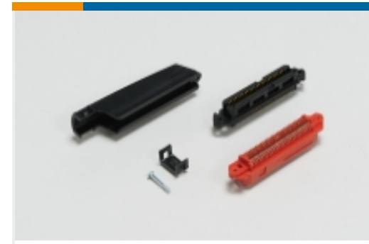
IDC D-Sub Connectors(76)